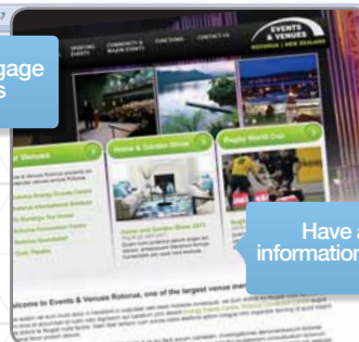
Have all of your event information stored in one place