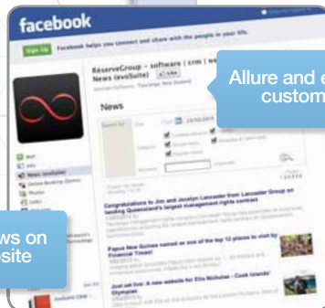
Allure and engage customers