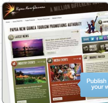
Publish news on your website